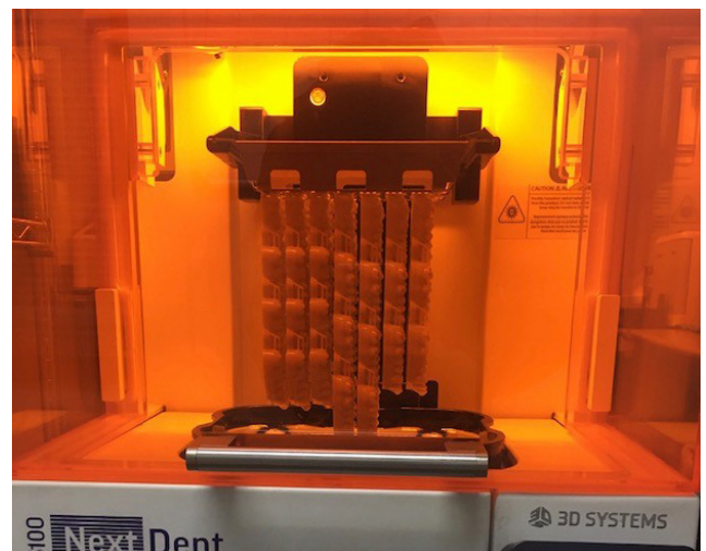
DenMat uses the auto-stacking feature on the NextDent 5100 digital dental solution to increase its production of orthodontic models by up to 4X.

With auto-stacking, DenMat increased output of orthodontic models by up to 4X, producing up to 96 models in an 8 hour shift.